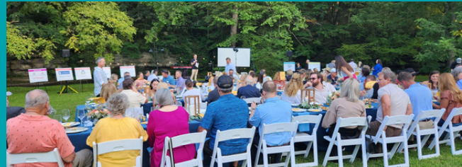
Photos from the SOLD OUT Creekside Cocktails & Cuisine Event.